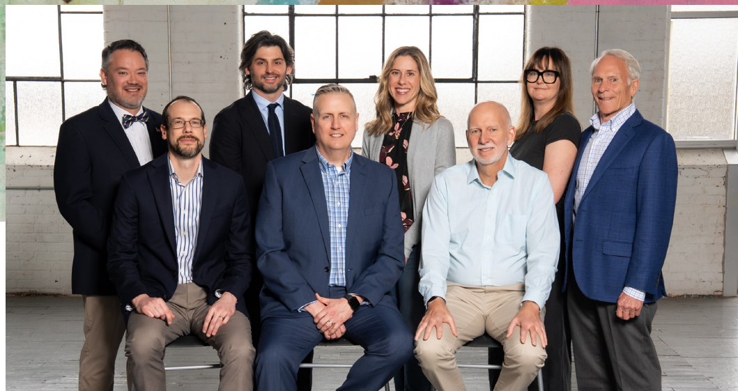
2024 GCCA Board Members